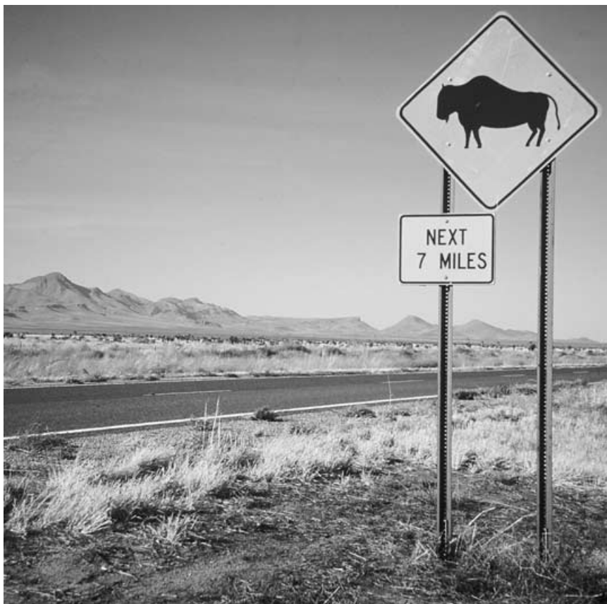
Figure 2. Evidence that the New Mexico Highway Department recognizes that there are free-ranging bison in the borderlands between New Mexico and Mexico (even if New Mexico Department of Fish and Game does not).

The land in the United States is privately owned. In Mexico the lands are a mixture of private and ejido (communal) land. The dominant economic activity on both sides of the border is cattle ranching, and Mennonite communities control some lands in Mexico that are predominantly devoted to agriculture. The private ranchers in the United States and Mexico do not like bison moving across their lands because bison knock down fences (including the international border fence) and are thought to compete with cattle for grass. In Mexico the bison are occasionally shot or trapped illegally despite their protected status (SEMARNAT 2002). In New Mexico bison are legally classified as livestock and are hunted to provide additional ranch income. The owners of one of the two ranches in the United States used by the bison pays agricultural taxes for and thus claims ownership of some of the bison, but the New Mexico Highway Department suggests that free-ranging bison are common enough to justify multiple highway signs (Fig. 2). In 1998 part of the