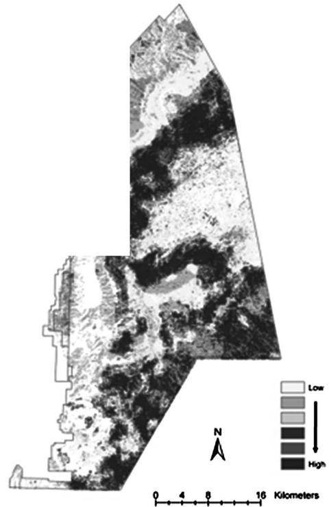
Figure 1. Habitat suitability model for Aplomado Falcons on the Armendaris Ranch. Map subset from model detailed in report (Young et al. 2002).

The Peregrine Fund employed standard raptor hacking (reintroduction) procedures for releasing 102 captive-bred Aplomado Falcons at the Armendaris Ranch from 2006 through 2011 in June, July, and August (Hunt et al. 2013). This procedure involved holding juvenile aplomados, with color VID (visual identification) and aluminum U.S.G.S. bands, in a hack box, for 7–10 d, on an elevated platform erected in suitable habitat, and then releasing them at an age when they would naturally fledge (Mutch et al. 2001). On release day, the box was opened remotely allowing the birds to emerge