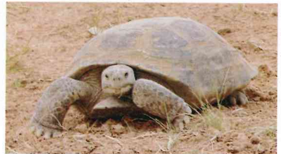
Adult female Bolson tortoises (like the one shown here) are ~15% larger than the adult males and can reach 390 mm (17 in) in length and >30 lbs.

Bolson tortoises get their scientific name ( flavomarginatus = yellow margined) from their yellow margins. Many individuals have yellow toenails as well. Known also as 'Tortuga Grande' and the 'Running Tortoise', their propensity to take off running to the nearest burrow distinguishes Bolsons from other tortoise species that are more likely to stay put and retreat into their shells.