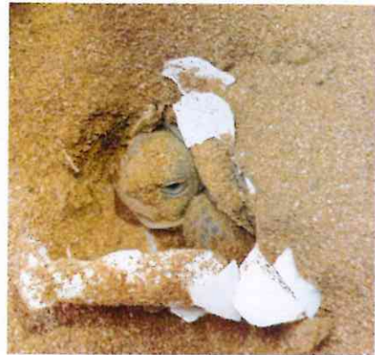
A Bolson tortoise hatchling emerges from its egg.

Similar to the other North American tortoise species, Bolson tortoises weigh ~25-40 g (1-1.5 oz) at hatching but unlike other species, top out near 12-15 kg (26-33 lbs) as adults. They take at least 15 years to reach sexual maturity. The female tortoise shown in this picture has been producing eggs since ~1975. Female Bolsons lay 2-9 eggs per clutch and 1-3 clutches per year.