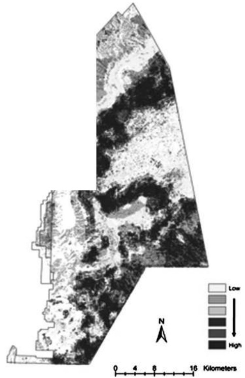
Figure 1. Habitat suitability model for Aplomado Falcons on the Armendaris Ranch. Map subset from model detailed in report (Young et al. 2002).

The Peregrine Fund employed standard raptor hacking (reintroduction) procedures for releasing 102 captive-bred Aplomado Falcons at the Armendaris Ranch from 2006 through 2011 in June, July, and August (Hunt et al. 2013). This procedure involved holding juvenile aplomados, with color VID (visual identification) and aluminum U.S.G.S. bands, in a hack box, for 7–10 d, on an elevated platform erected in suitable habitat, and then releasing them at an age when they would naturally fledge (Mutch et al. 2001). On release day, the box was opened remotely allowing the birds to emerge