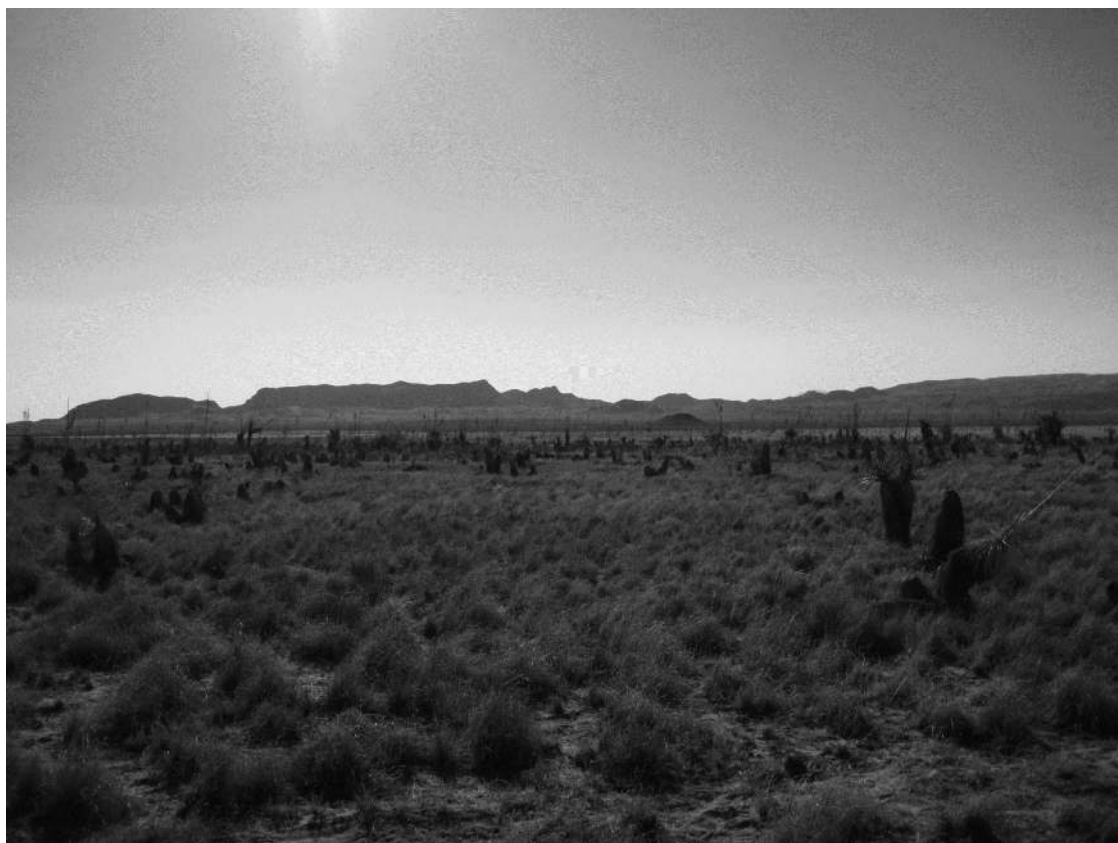
Figure 2. Open grassland savanna with scattered tree yuccas in the central portion of the Armendaris Ranch.

40 d of free-flying experience, owing to their captive origins. We proposed that extending the feeding program would allow these birds to gain more experience, without being food-stressed, which could increase their survival.