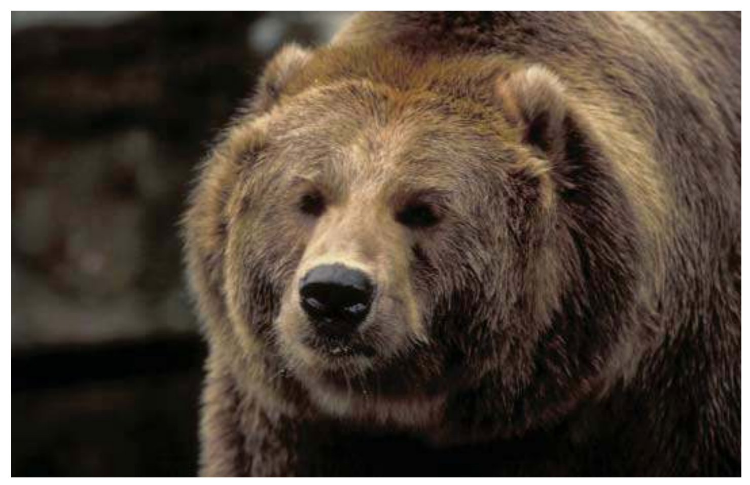
Grizzly bears are among the rare animals welcome at the Flying D Ranch in Montana.

indicate a healthy or at least a recovering landscape.