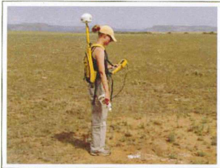
Post-release monitoring in typical habitat